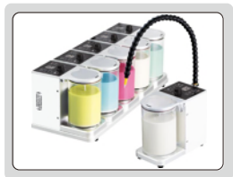
Dripping system (optional)