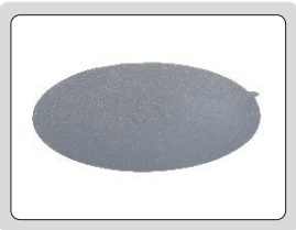
Silicon carbide paper (included)

* □□ is granularity specification, for example, code MLP-DLA40 stands for 40um