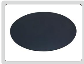
Magnetic pad (included)